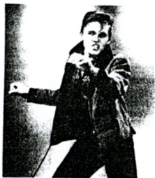
10.40pm Sound and Fury: Omnibus examines the whirlwind success of legendary rock 'n' roll star Billy Fury